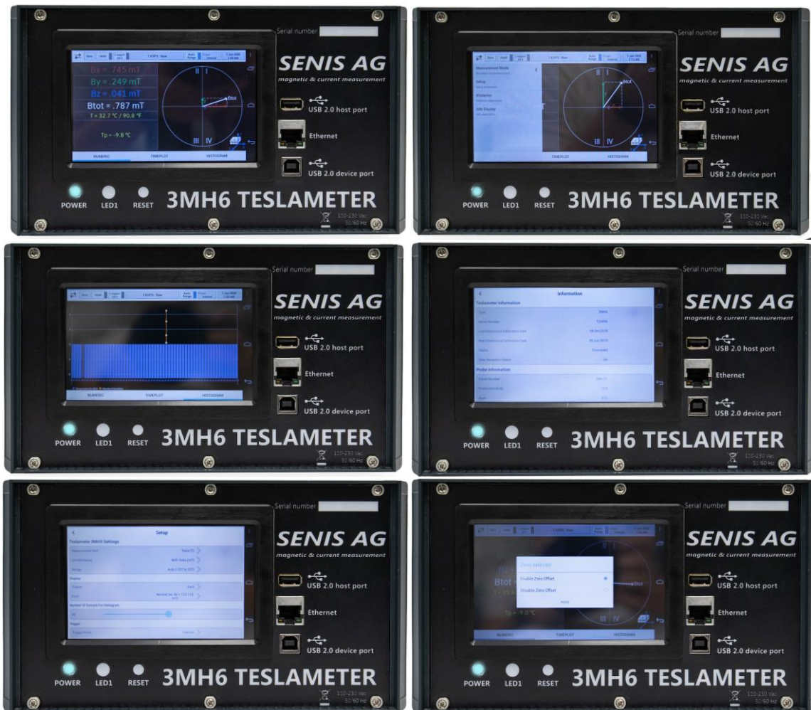
Figure 4: Visualization Modes (Numeric, Plot, Histogram) and Setting possibilities; External/Internal Triggers; Data Recording; Auto range; Zeroing; Min/Max; Hold reading;