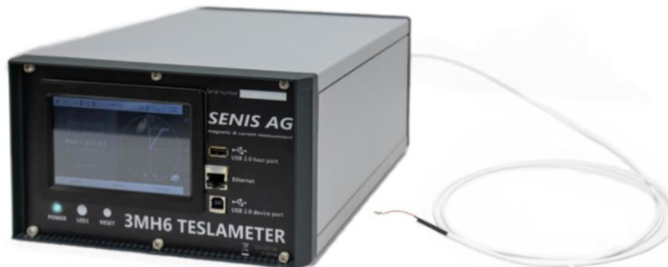
Figure 1: 3MH6 Teslameter